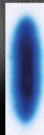
Fan LXT HVLP 325-330 mm.