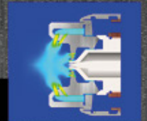
CONVENTIONAL high transference systems