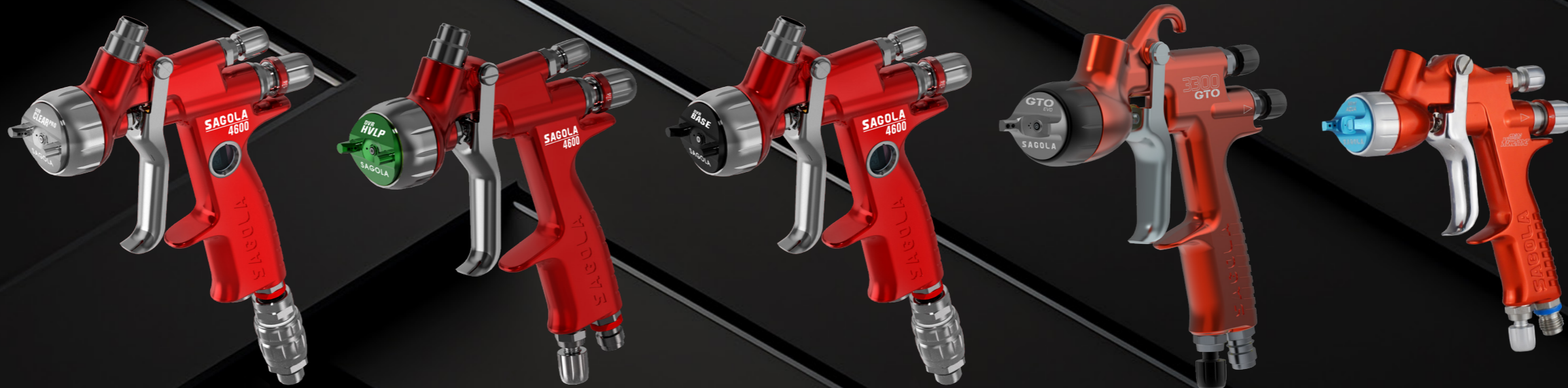
DVR CLEAR PRO SAGOLA 4600